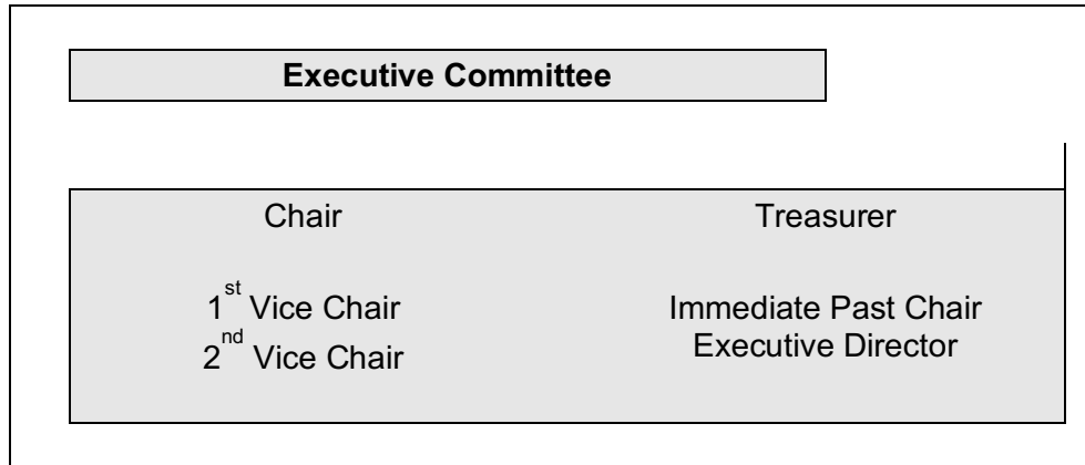
CHART OF ORGANIZATION

General Powers: The Executive Committee shall possess and exercise all powers of the Board of Trustees during the intervals between meetings of the Board of Trustees.